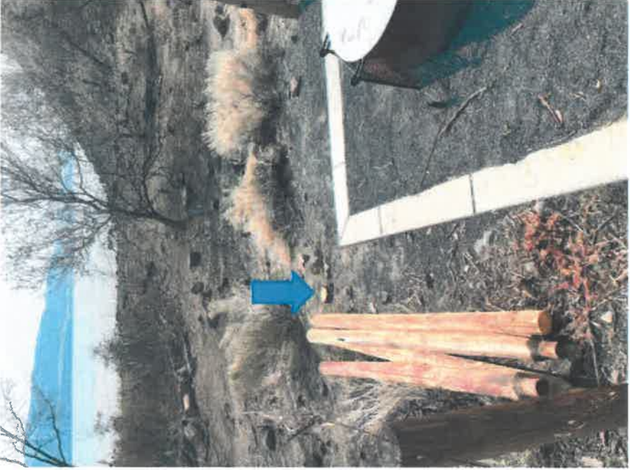
Fence Post @ Campsite