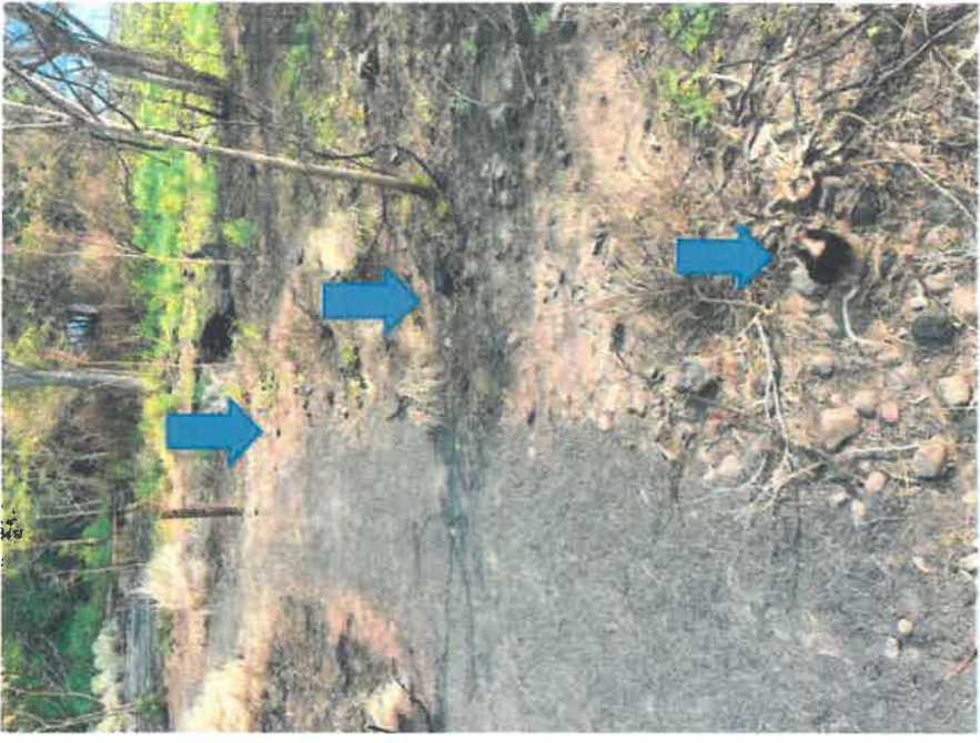
Fence Posts along path